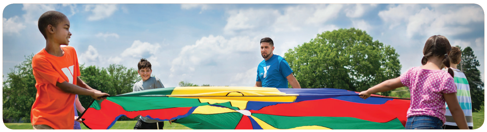
This camp must comply with regulations of the Massachusetts Department of Public Health and be licensed by the local board of health.